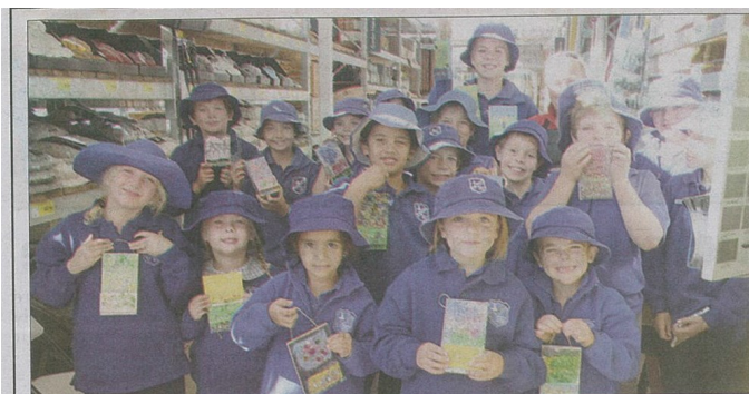
Lue Public School students with the timber key holders they made at Bunnings 030516 BUNNINGS 000013